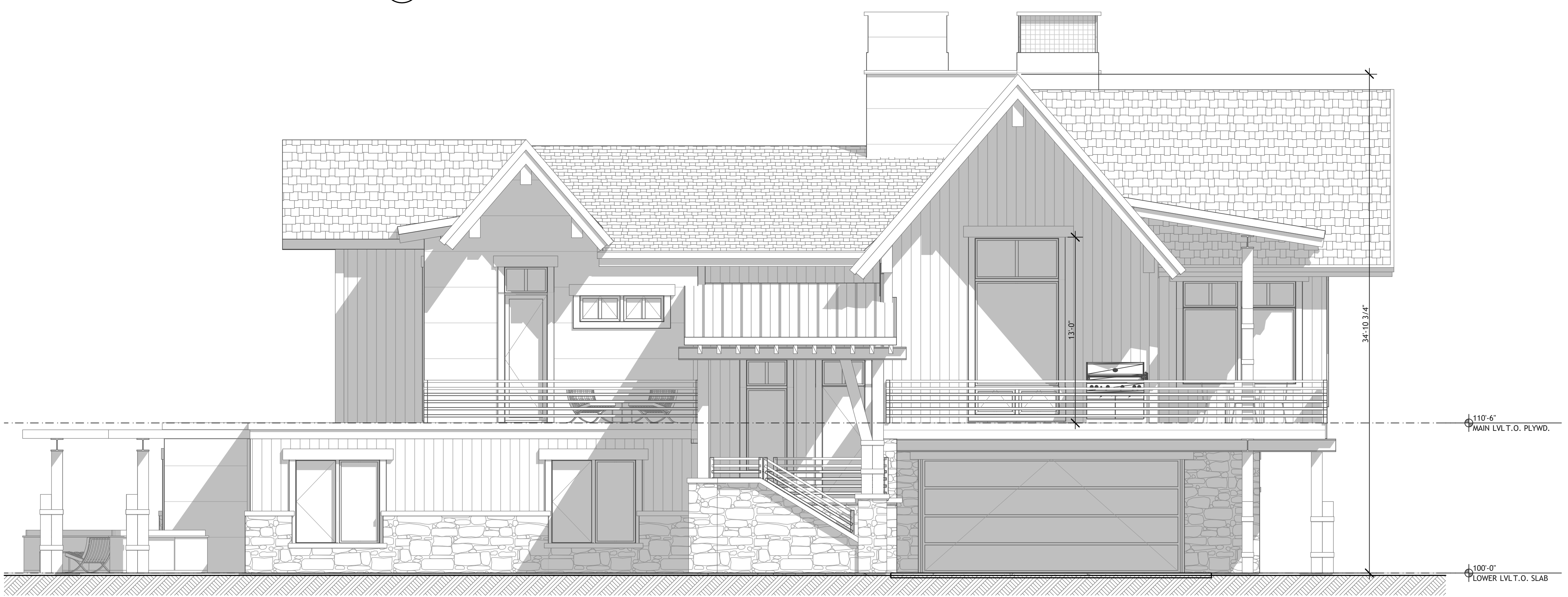
1 ELEVATION SCALE: 1/4" = 1'-0"

CUCUMBER CREEK ESTATES DUPLEX CUCUMBER DRIVE BRECKENRIDGE, CO 80424