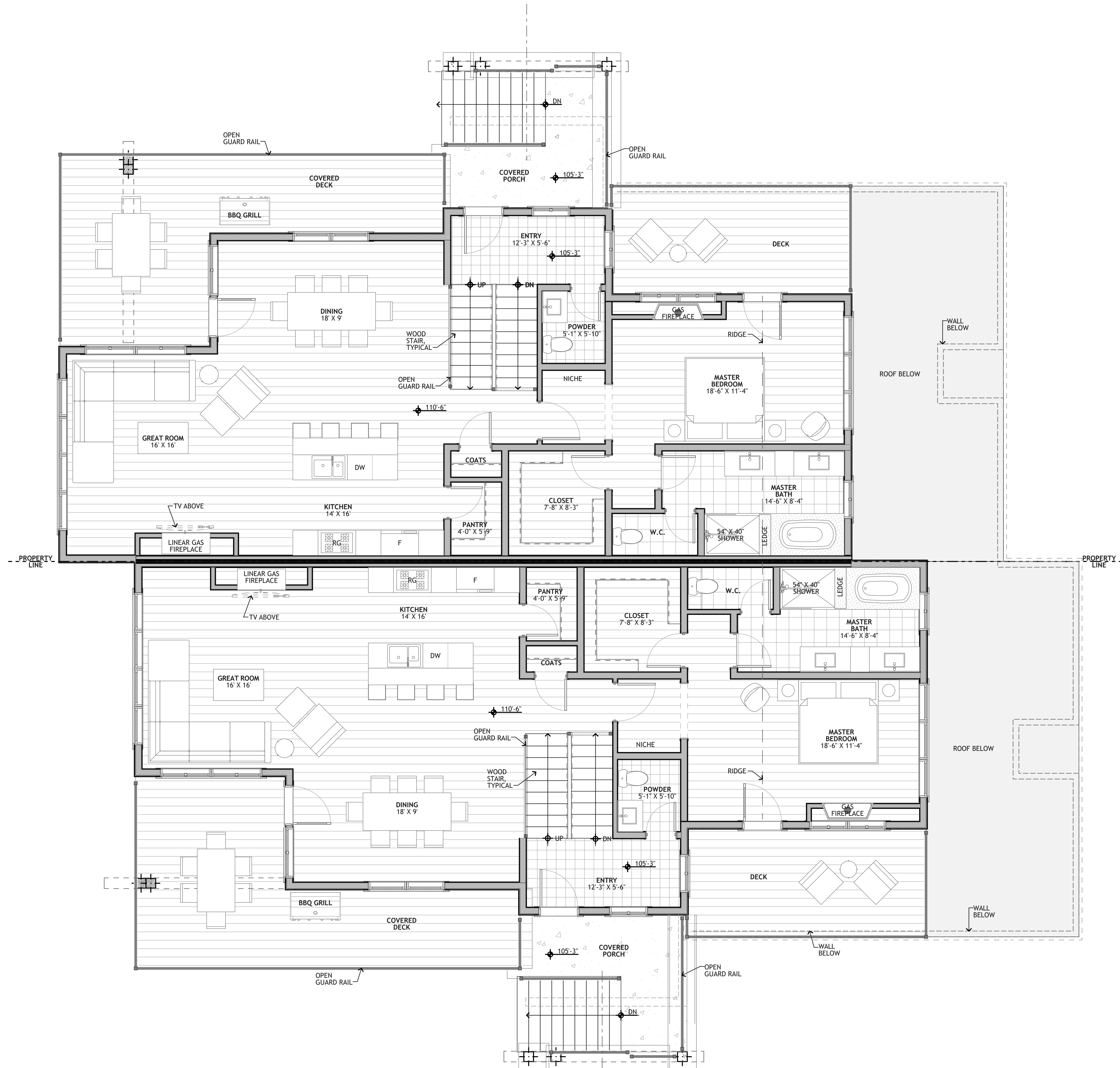
1 MAIN LEVEL FLOOR PLAN SCALE: 1/4" = 1'-0"