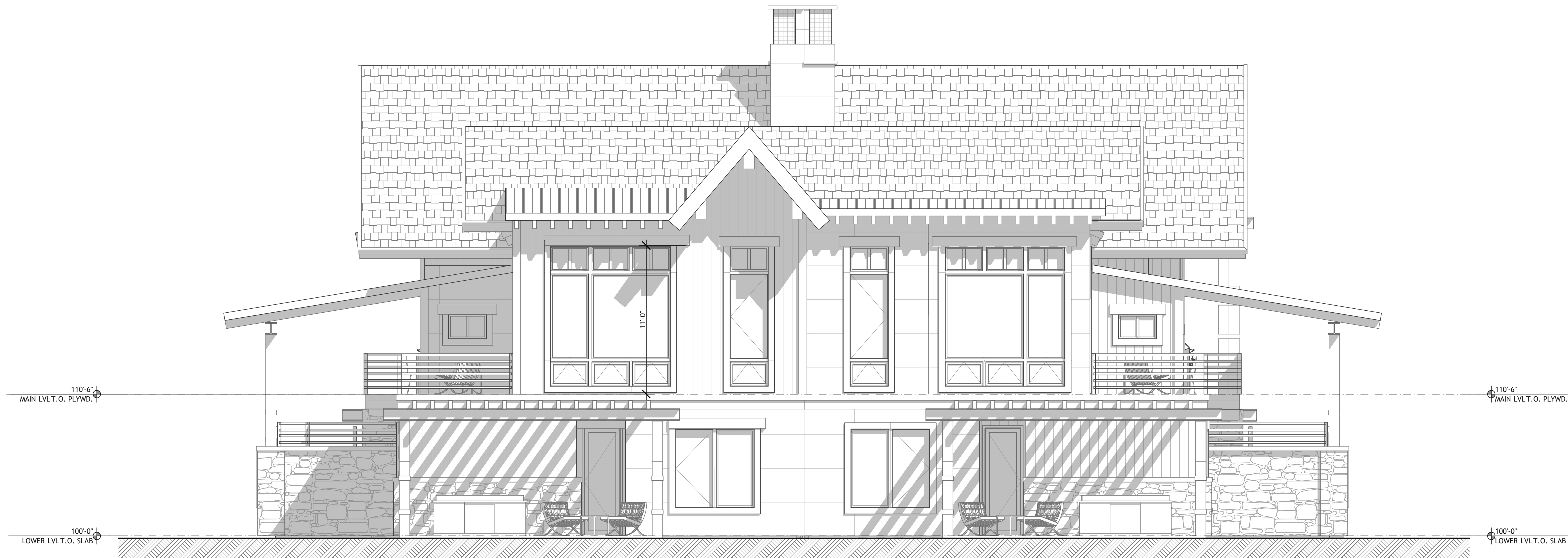
2 ELEVATION SCALE: 1/4" = 1'-0"