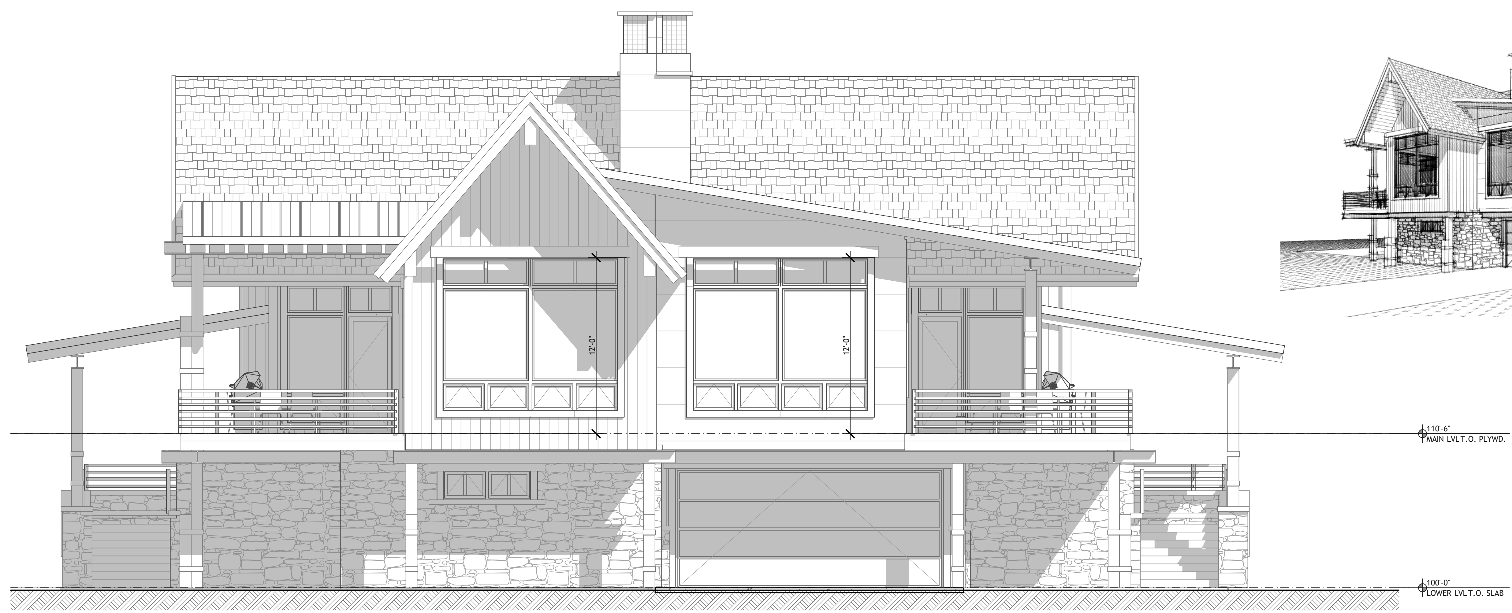
2 ELEVATION SCALE: 1/4" = 1'-0"